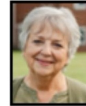
Minister Martha Temple Fragrance of the Arts