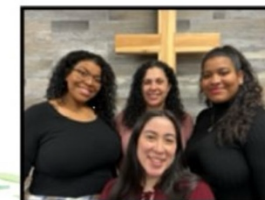
Shabach Preachers in Ballerina Slippers New Life, Chelsea, MA